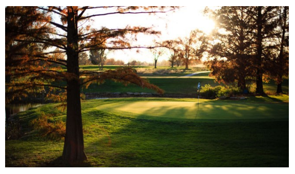
Swope Memorial Golf Course