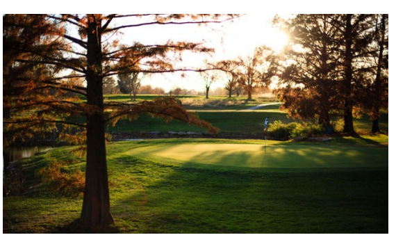
Minor Park Golf Course