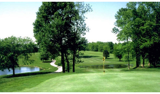
Shoal Creek Golf Course