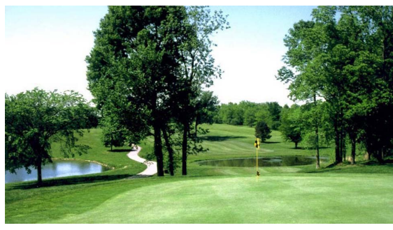
Hodge Park Golf Course