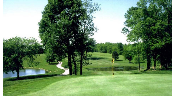
Hodge Park Golf Course