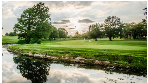
Minor Park Golf Course