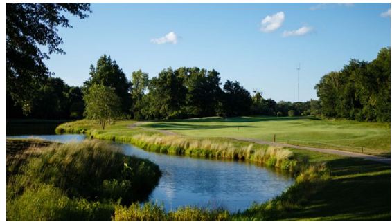
Heart Of America Golf Course

Heart of America Golf Course / Tom Watson Golf Academy offers the ultimate learning and playing opportunities in the heart of Swope Park. This facility is pure fun and recreation for anyone of any age and any skill. HOA offers three options: a beautiful regulation-length 9-hole course; a fun par-three 9-hole course; and a Tom Watson-designed junior course. HOA is home of the Tom Watson Golf Academy and also offers the best junior golf programs in Kansas City. The First Tee of Greater Kansas City, an organization that promotes the game of golf to youth in urban areas, has its offices at HOA as well. No matter where you live in Kansas City, these regulation courses provide great values that are convenient and give even the newest golfers a place to learn and play.