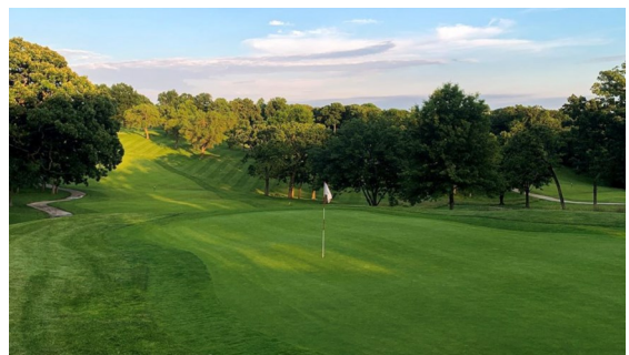
Swope Memorial Golf Course