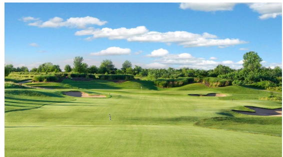
Shoal Creek Golf Course