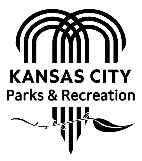
Pocket Reference Book