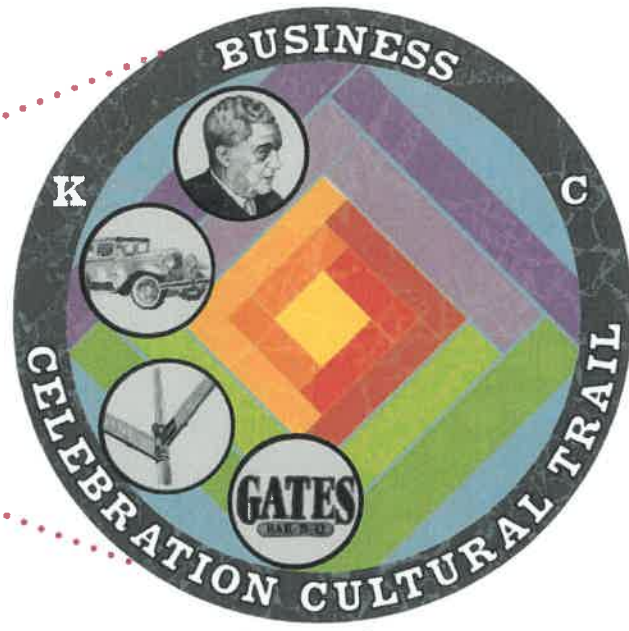
In-Ground Art Piece