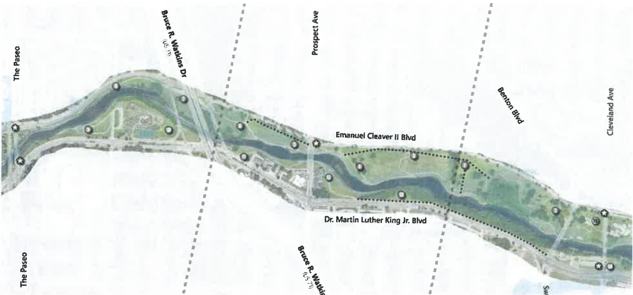
Location Map – Plazas located at numbered nodes