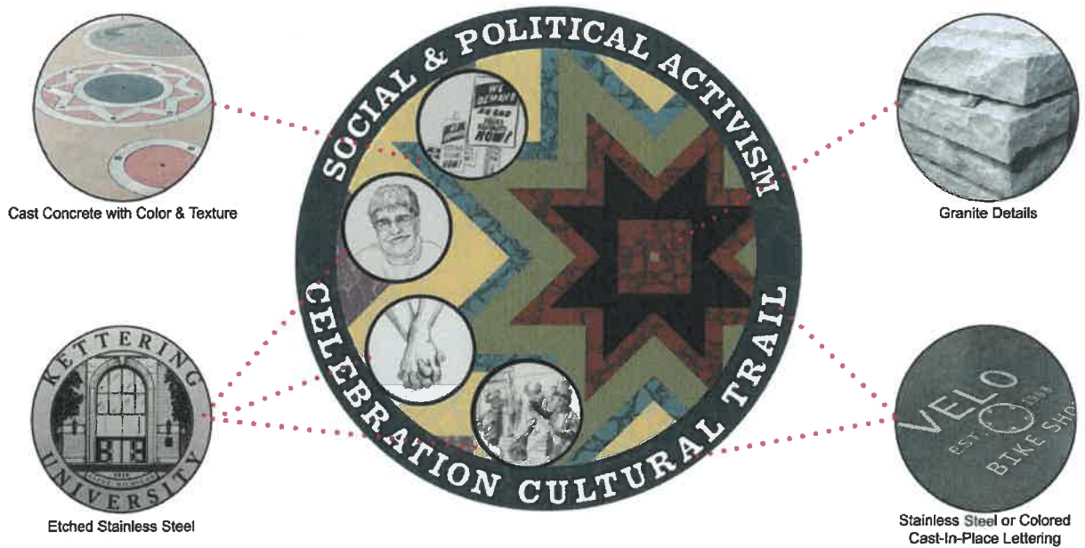
Cast Concrete with Color & Texture