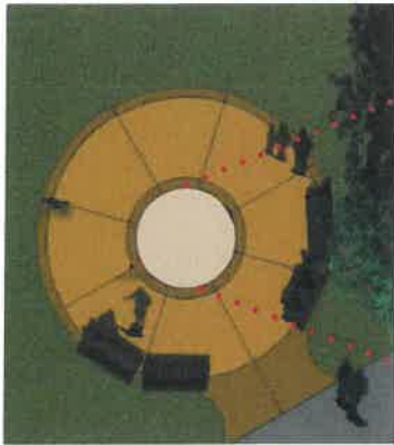
Plan View - Site

LOCATION - Celebration Cultural Trail In-Ground Art