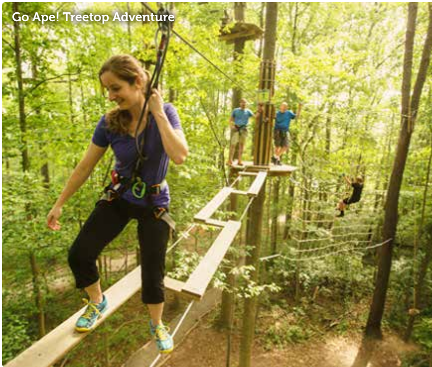
Go Ape! Treetop Adventure