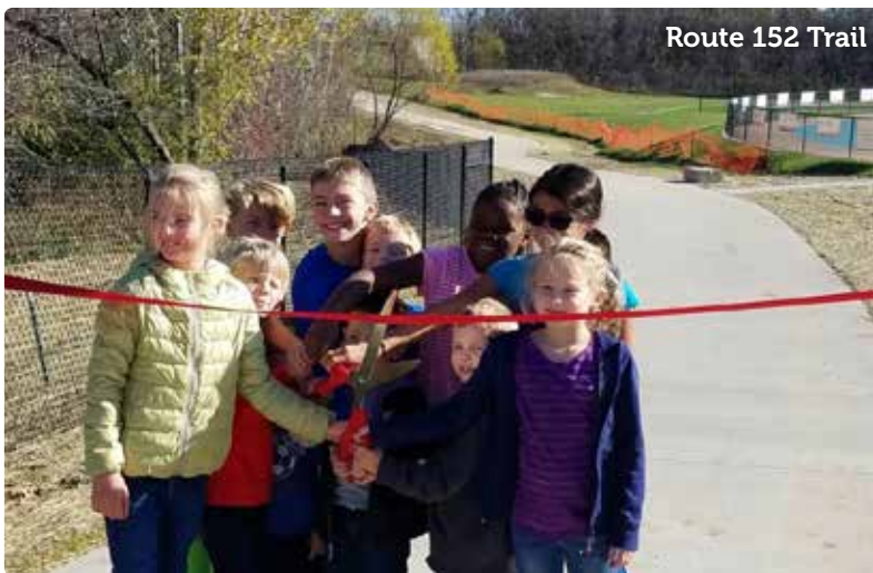
Route 152 Trail

The aesthetic of the junction was also vastly enhanced with the installation of metal walls on the corners bearing the names of Historic Northeast, Independence Plaza and Scarritt Renaissance, brick pavers, seat walls, and neighborhood markers. Trees and bioswale plants were added to green up the area and assist with drainage.