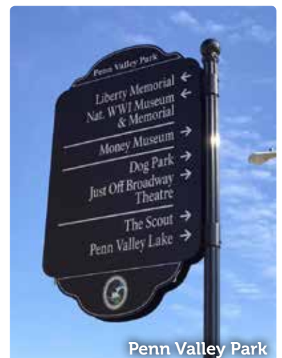
Penn Valley Park

Overall, three types of signage were installed: Wayfinding — both pedestrian and vehicular; Destination-signs for individual activity/arrival points; and Secondary Entry Signage — stone columns placed at secondary entrances around the park that announce the arrival to Penn Valley Park and include a brief list of destination points near that entrance.