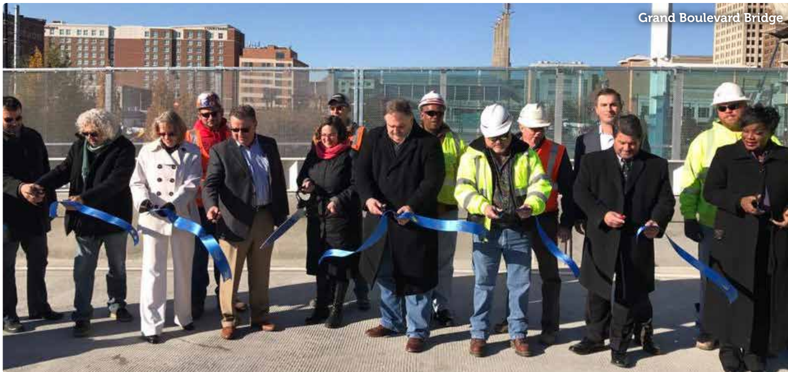
Grand Boulevard Bridge