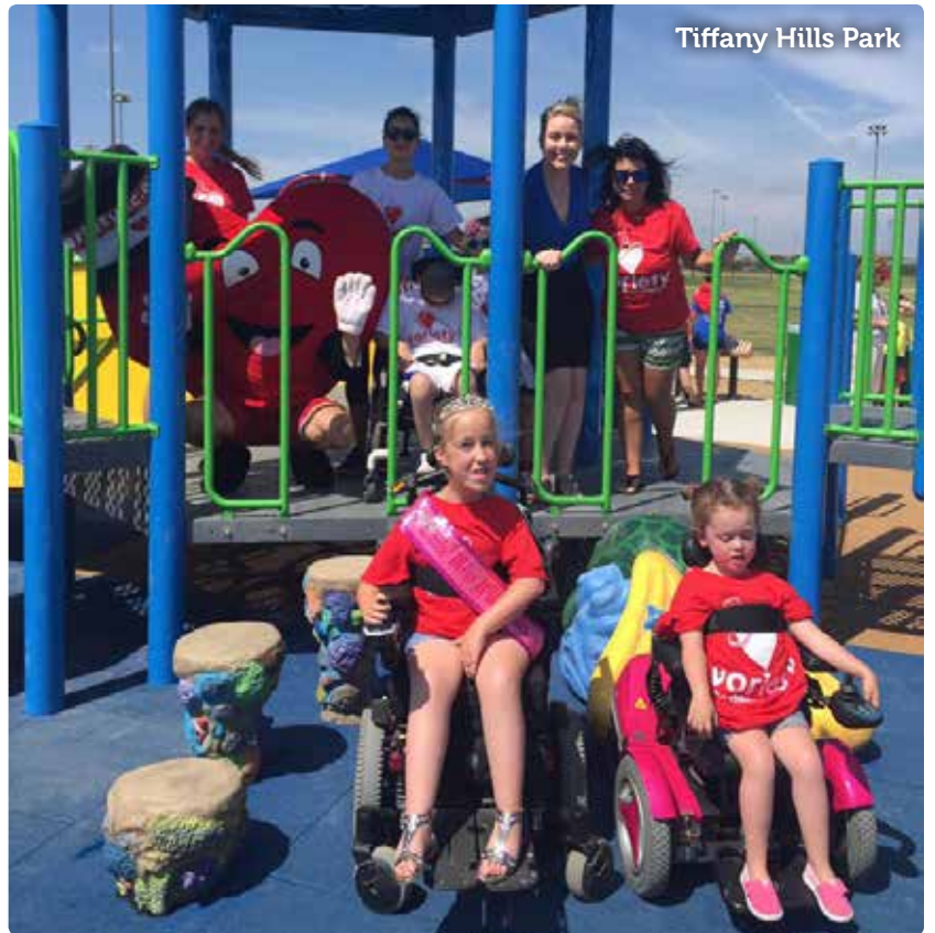
Tiffany Hills Park