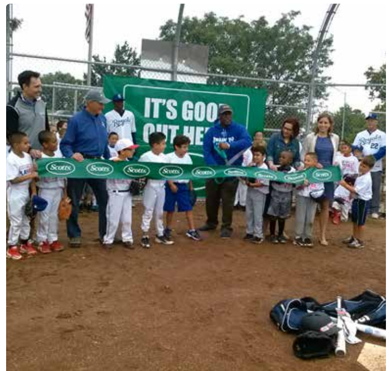
Ball Field Opening at Mulkey Square

Ponies and Pumpkins at Little Blue Valley Park