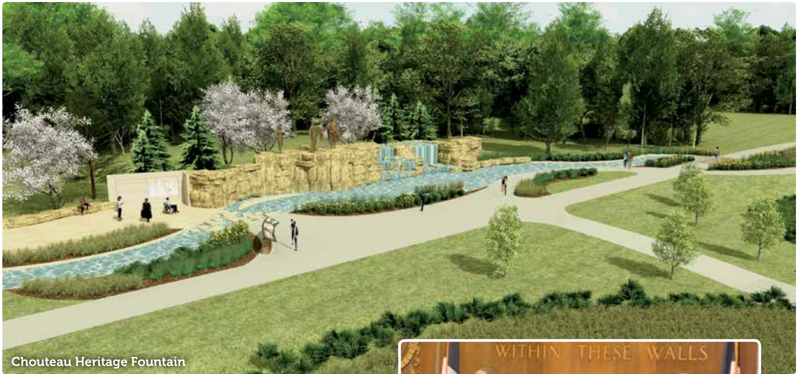
Chouteau Heritage Fountain