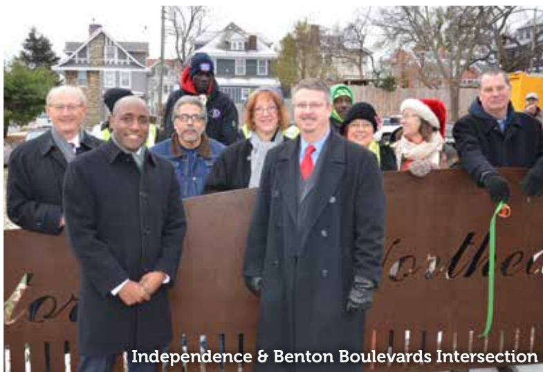
Independence & Benton Boulevards Intersection