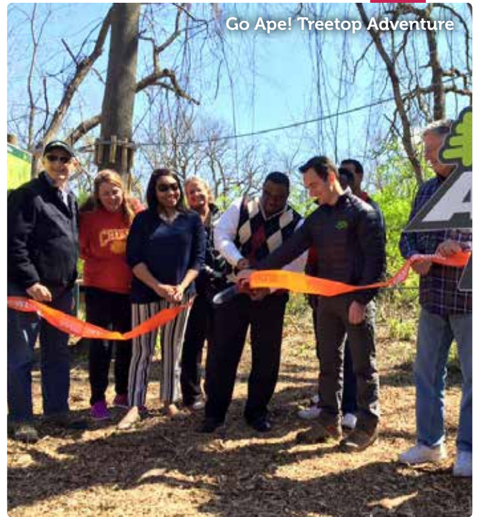
Go Ape! Treetop Adventure