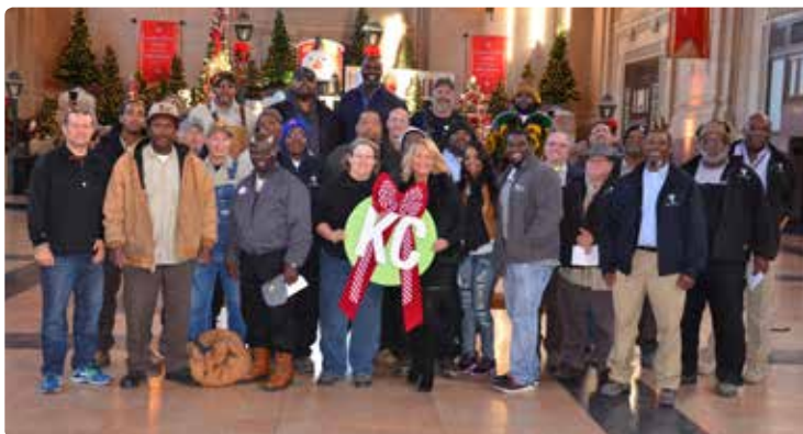
KC Parks Employee Service Awards

PGA Retailer of the Year: Shoal Creek Golf Course