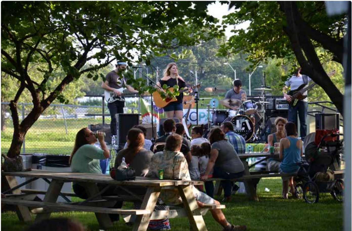
Feast of Fountains

1 Million+ Thank You Event at the Kansas City Zoo in Swope Park