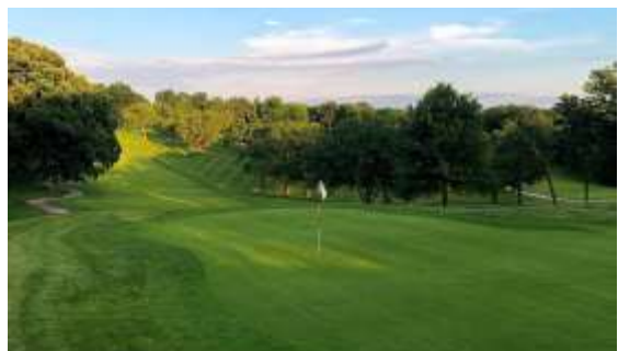
Swope Memorial Golf Course