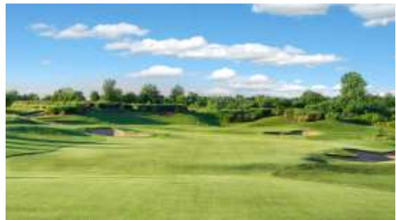
Shoal Creek Golf Course