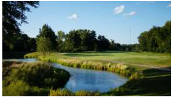
Heart Of America Golf Course

Heart of America Golf Course / Tom Watson Golf Academy offers the ultimate learning and playing opportunities in the heart of Swope Park. This facility is pure fun and recreation for anyone of any age and any skill. HOA offers three options: a beautiful regulation-length 9-hole course; a fun par-three 9-hole course; and a Tom Watson-designed junior course. HOA is home of the Tom Watson Golf Academy and also offers the best junior golf programs in Kansas City. The First Tee of Greater Kansas City, an organization that promotes the game of golf to youth in urban areas, has its offices at HOA as well. No matter where you live in Kansas City, these regulation courses provide great values that are convenient and give even the newest golfers a place to learn and play.