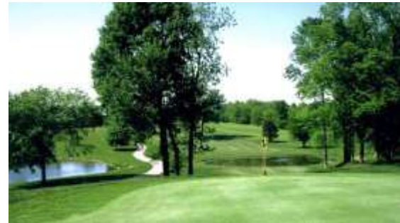
Hodge Park Golf Course