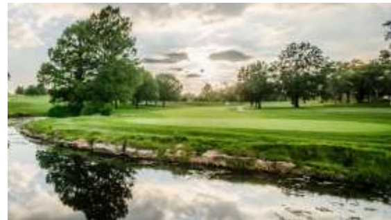
Minor Park Golf Course