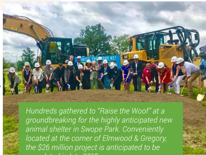
Hundreds gathered to "Raise the Woof" at a groundbreaking for the highly anticipated new animal shelter in Swope Park. Conveniently located at the corner of Elmwood & Gregory, the $26 million project is anticipated to be completed in late 2019.