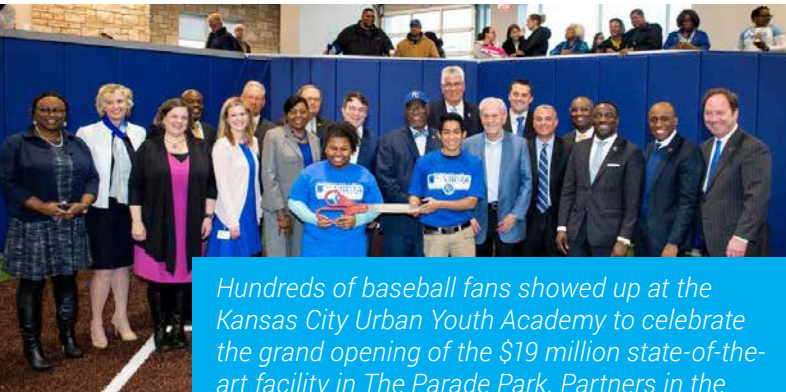
Hundreds of baseball fans showed up at the Kansas City Urban Youth Academy to celebrate the grand opening of the $19 million state-of-the-art facility in The Parade Park. Partners in the facility include Major League Baseball, Kansas City Royals and KC Parks.

Let's Play! Festival in West Terrace/Case Park