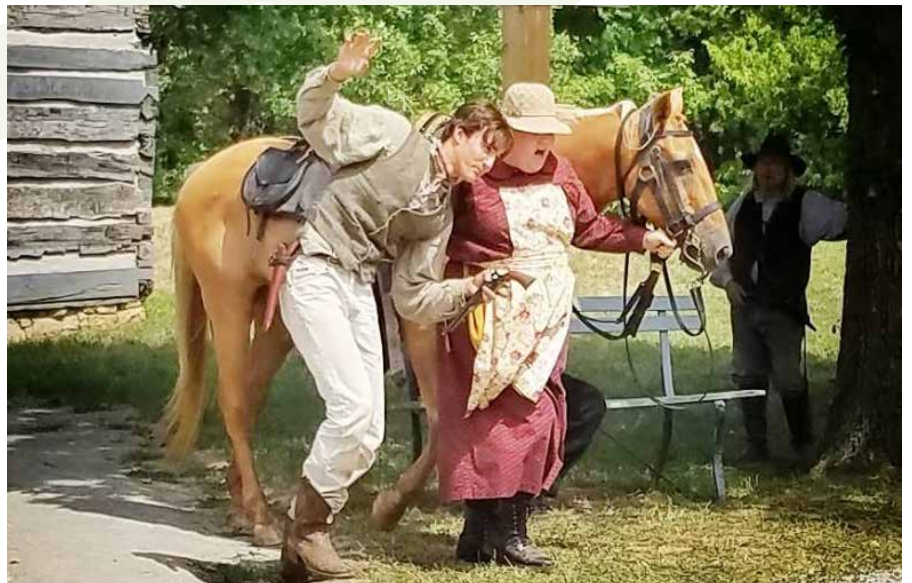
Cover photo: "Big Bubbles at the Big Picnic" by Ruben Gusman

Finalist for the NRPA July 2018 magazine cover