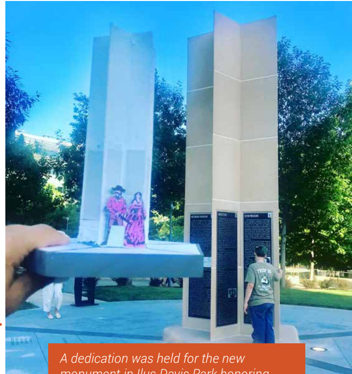
A dedication was held for the new monument in Illus Davis Park honoring The Native Sons and Daughters of Greater Kansas City, Inc., an organization dedicated to the historic preservation of the unique and rich heritage of greater Kansas City. History @ Monument events were held throughout the summer to raise awareness of the new marker and educate the public on Kansas City's history.